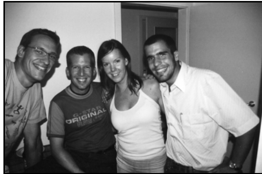
Me with some of my colleagues at Audi