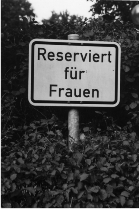
A funny parking sign