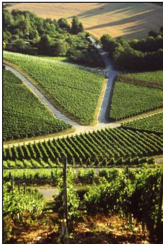
Wine cultivation at dawn