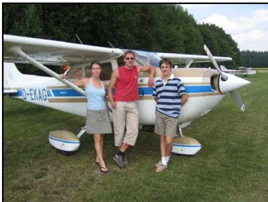
Flying with a colleague