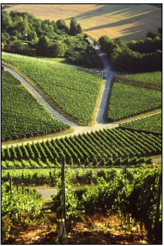
Wine cultivation at dawn