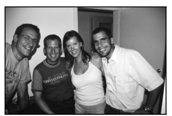
Me with some of my colleagues at Audi