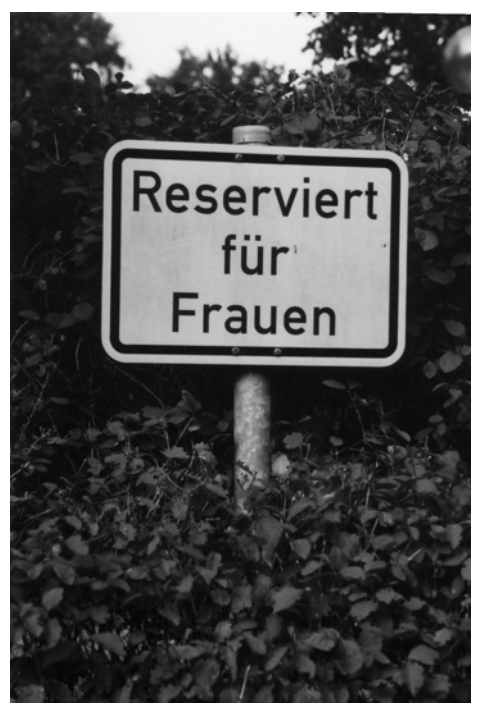
A funny parking sign