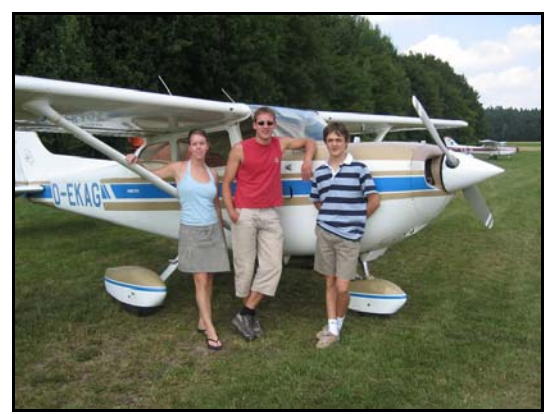
Flying with a colleague