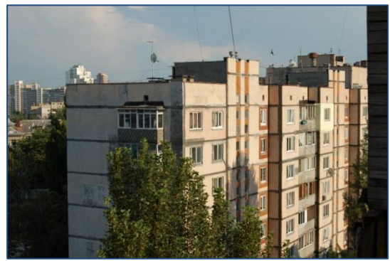
Residential area in Kiev

Here, in the middle of everyday gripes and political betrayal, we live, me and nine other students from all over of Europe. The colors of the sixteen-story buildings in our block have faded since their new built prime in the Soviet years. The babushkas are growing vegetables in the courtyard, the children are roller-skating on the uneven pavement and the men are drinking beer on a shady bench; it is a lively neighborhood that at once made me feel at home.